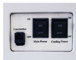
LAN Port Access