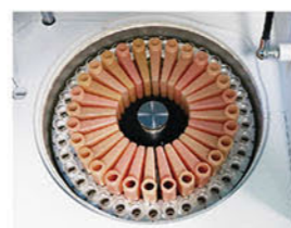
Reagent Tray Refrigerated tray with independent switch.