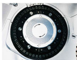
Reaction Tray 37±0.1°C, real-time monitor.