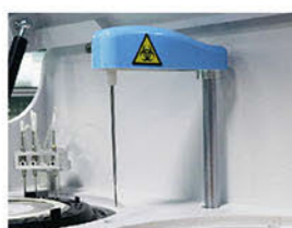
Sample Needle Liquid level sensor function. Anti-collision function. Reagent volume real-time detection.