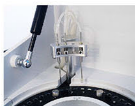
Washing Probe Independent 2-step washing system.