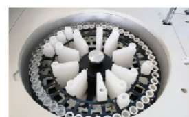
Reagent Tray 2~8°C cooling for 24 hours.