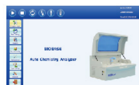
Software User-friendly software.