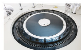
Reaction Tray 37±0.1°C, real-time monitor.