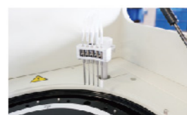
Washing Probe Independent 4-step washing system.